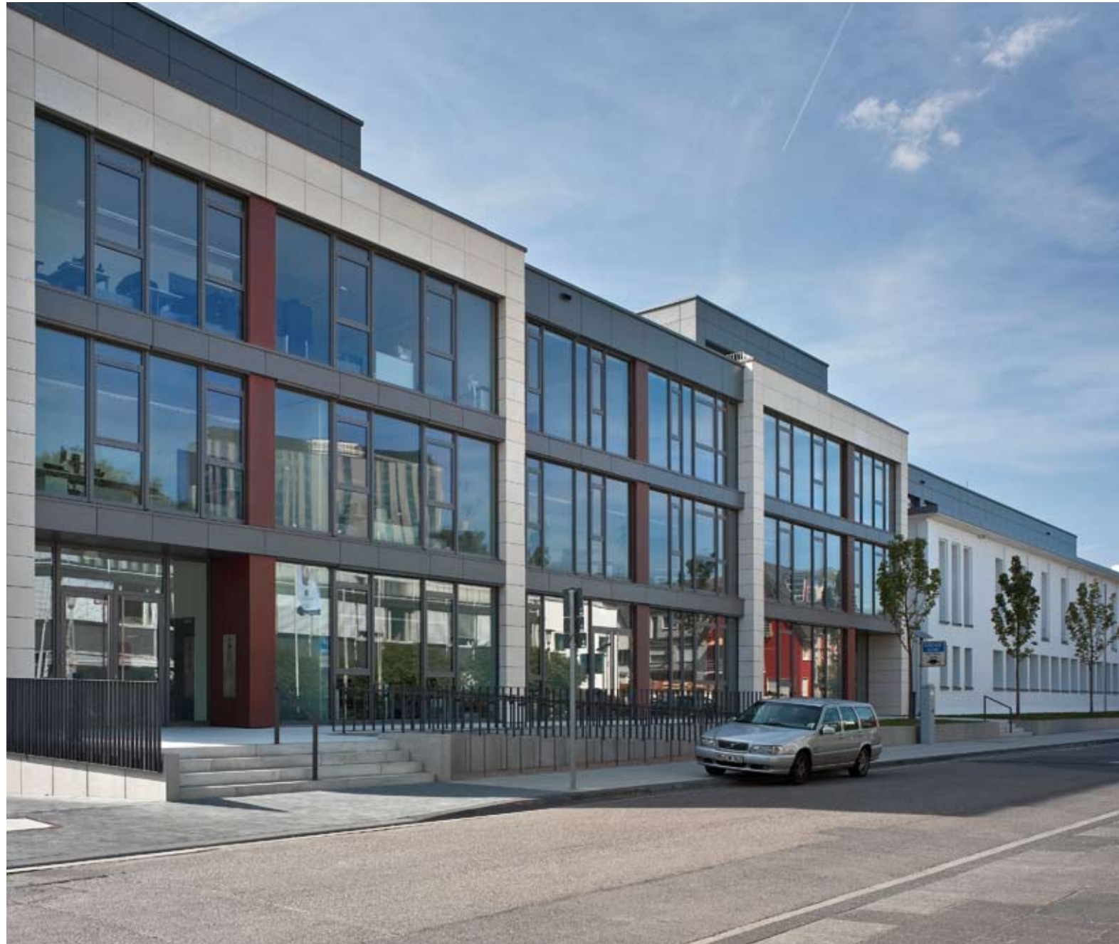
↑ | Façade , entrance area on Schlegelstraße → | Façade , facing Willy-Brandt-Allee

Address: Willy-Brandt-Allee 11, 53113 Bonn, Germany. Client: Art-Invest Real Estate, Cologne, Pareto GmbH, Cologne. Completion: 2012. Gross floor area: 18,100 m 2 . Landscape architects: RMP Landschaftsarchitekten, Bonn. Main materials: lime stone, aluminum façade elements, cupreous panels. Number of work stations: 350. Ventilation: geothermal energy, cooling ceiling. Types of offices: individual, group, business club, moveable walls. Conference rooms: 15/60 people. Setting: urban.